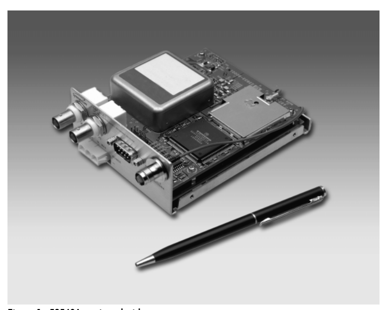
Figure 1. 58540A as viewed without cover.

When the crystal oscillator is locked to the GPS signal, the frequency accuracy of the 10 MHz signal is better than 1 \times 10^{-11} for a one-day average, and the 1PPS signal is synchronized to universal coordinated time, UTC (USNO MC) within 110 ns rms (95% probability).